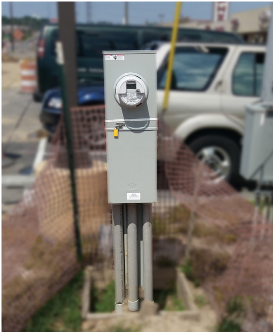
U6221 installation in Gambills, Maryland.