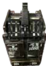
Breaker with insulator in place

The U5168 can be used for both residential and commercial applications.